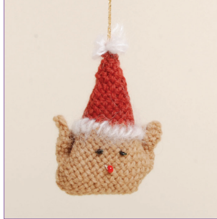
Designed and woven by Stephanie Flynn Sokolov

Notions: Matching sewing thread, sewing needle, Black Cherry Kool-Aid, two black seed beads, one red seed bead, credit card size hard plastic card, microwave oven, plastic wrap, small amount of fleece or fiberfil.